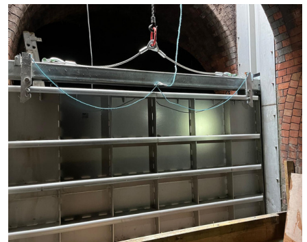
lowering the new stainless-steel chases