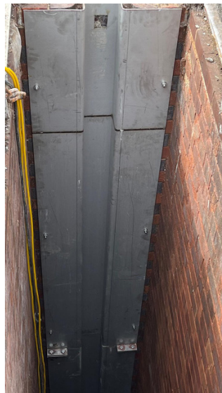
New stainless-steel recesses