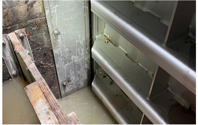
Stainless-steel chases in position

Initial phases included cleaning, minor repairs, and commissioning of four new actuators. Electrical connections were also completed, ensuring seamless integration with the existing penstocks.