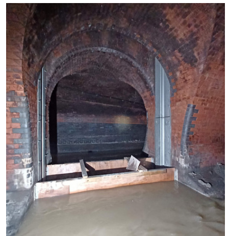
Sewer area during preparation