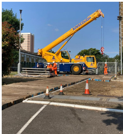
Heavy-duty wooden matting created for access

The site has evolved through successive upgrades and interventions, adapting to advancements in engineering and changing regulatory standards. This rich history underscores the significance of modernising and maintaining the assets at Wick Lane to ensure reliability and resilience for future generations.